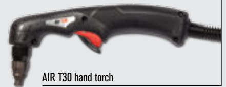
AIR T30 hand torch